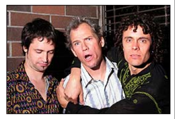
The Dead Kenny Gs play Luna Wednesday.

GATHERINGS "Renewable Energy: A Good Investment for Your Business?" forum with speakers Jeff Cogen and Jim Green, 7am, Downtown Athletic Club. Register at (503) 222-1963 ext. 100. $25, includes breakfast.